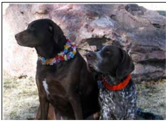
New kids at the SWRS enjoying their new home

NON PROFIT ORG. U.S. POSTAGE PAID SAN SIMON, AZ 85632 PERMIT NO. 436105